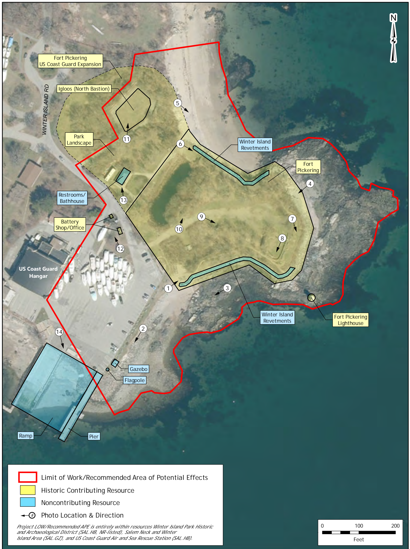
Figure 3 (Figure 8 in Report). Map showing historic aboveground properties listed in the State and National Registers and in MACRIS and nonhistoric resources in the recommended APE.