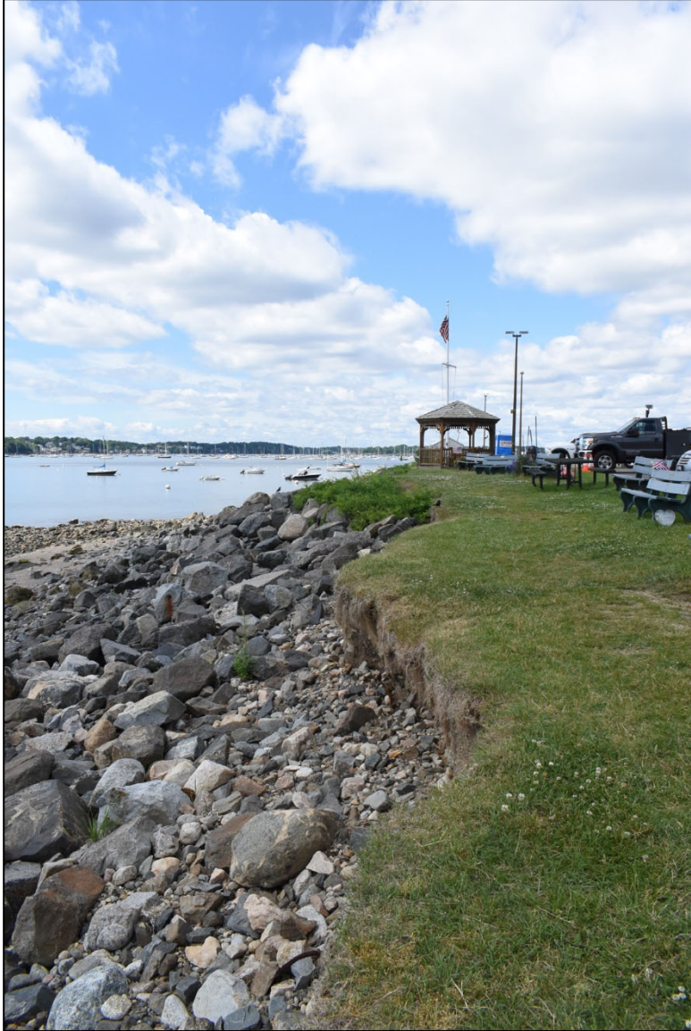
Photo 2. Coastal bank along parking lot, view south towards Gazebo and Flagpole.