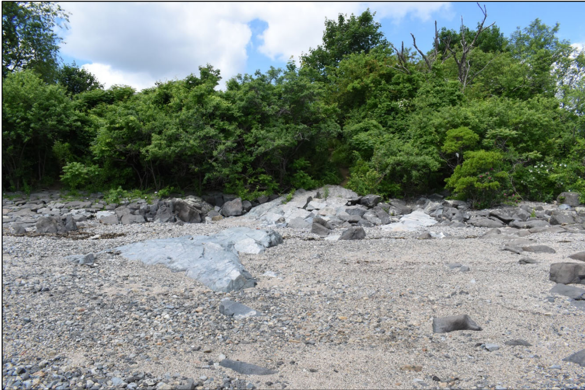
Photo 4. East side of Fort Pickering and Winter Island Revetments with informal dirt trail, view southwest.