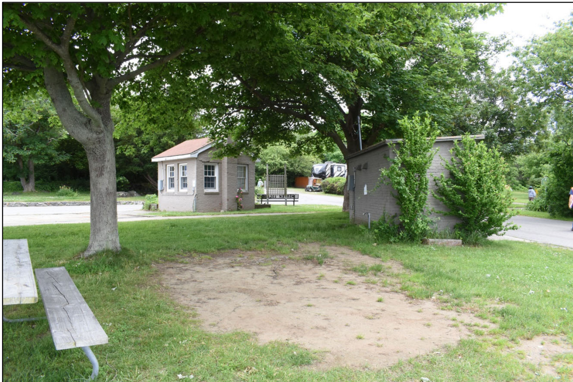
Photo 12. Battery Shop/Office (right and left), view north from parking lot.