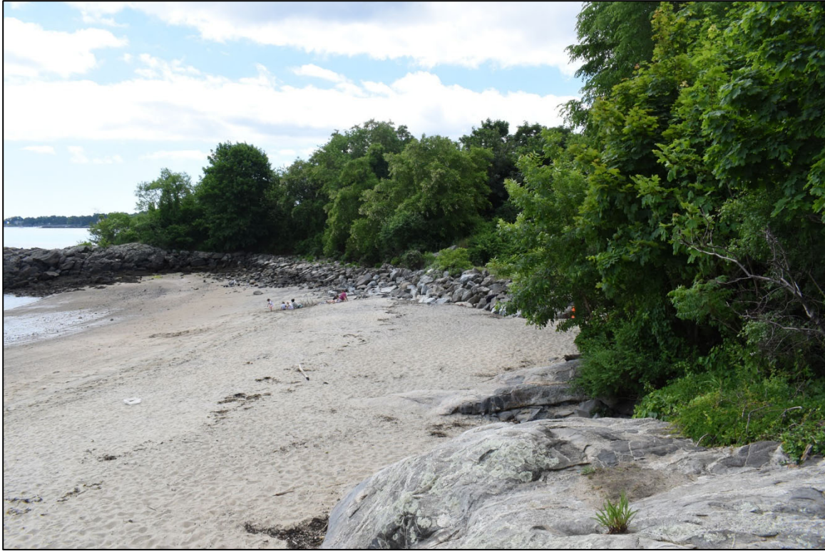
Photo 5. North side of Fort Pickering and Winter Island Revetments, view southeast.