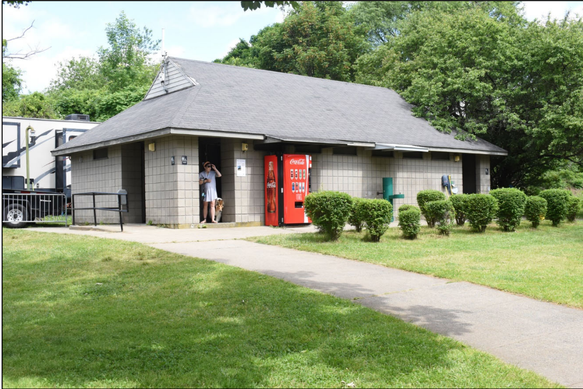
Photo 13. Restrooms/Bathhouse, view north.