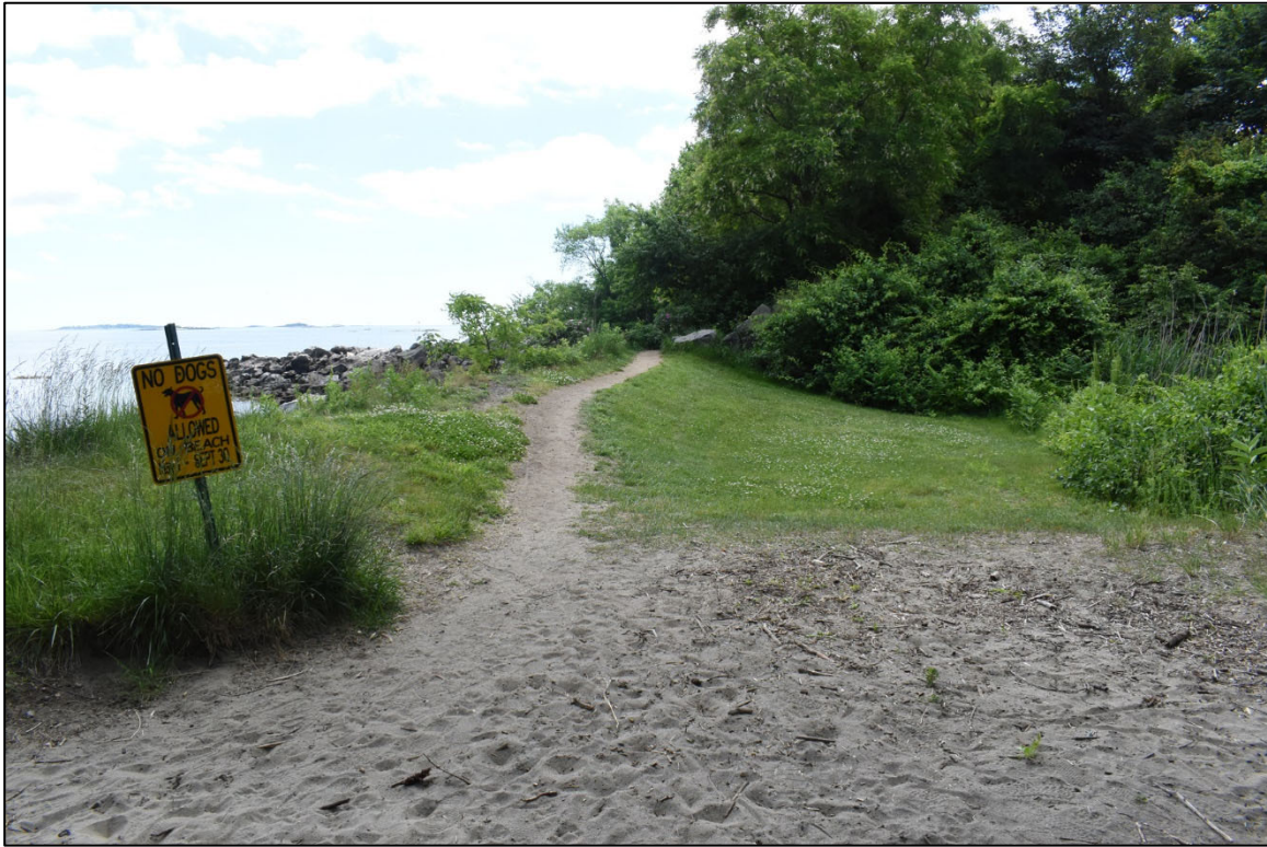
Photo 6. Informal dirt trail ascending west side of Fort Pickering, view east.