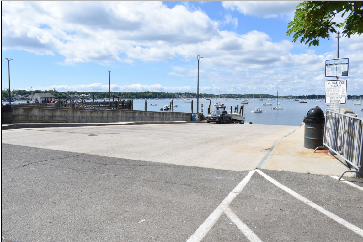
Photo 14. Ramp and Pier, view south from parking lot.