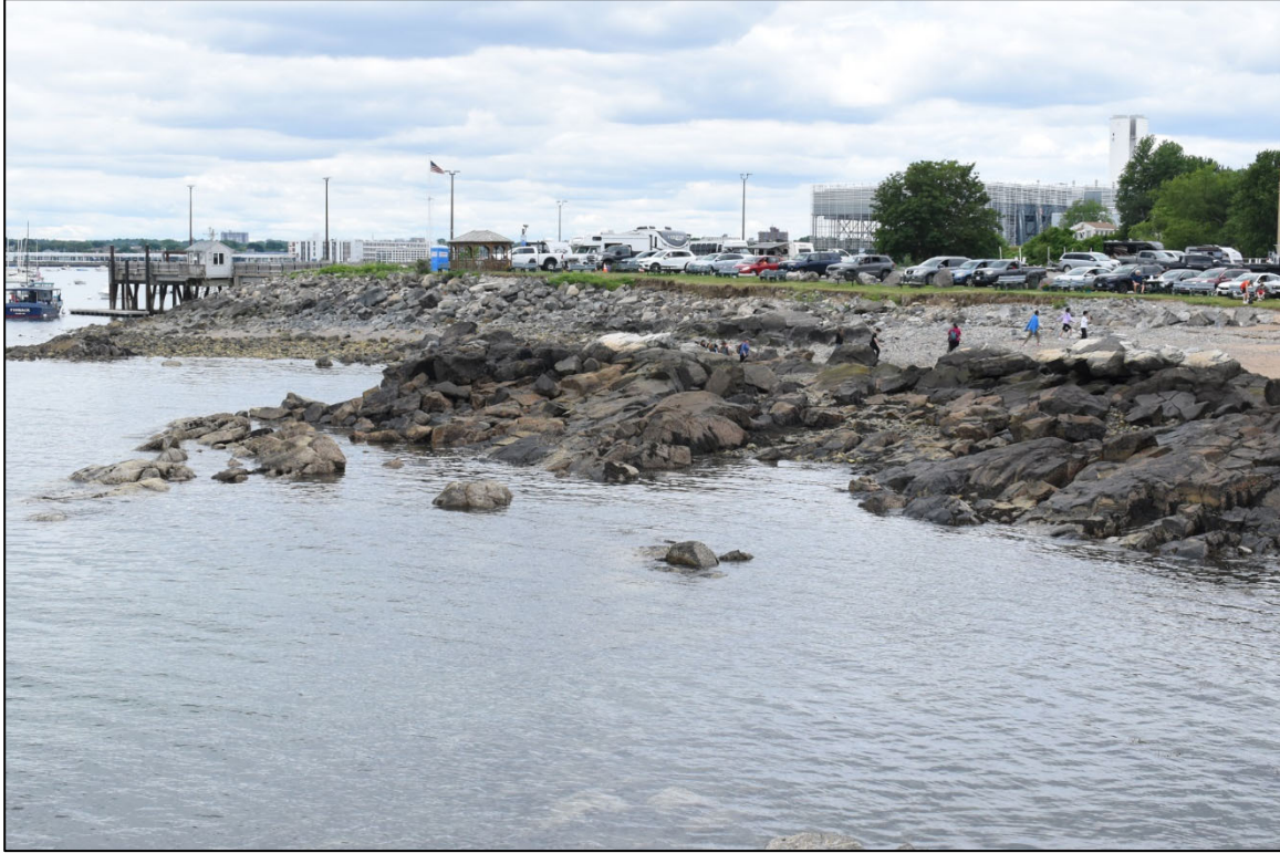
Photo 3. Coastal bank along parking lot, view southwest towards Pier, Flagpole, and Gazebo (left to right).