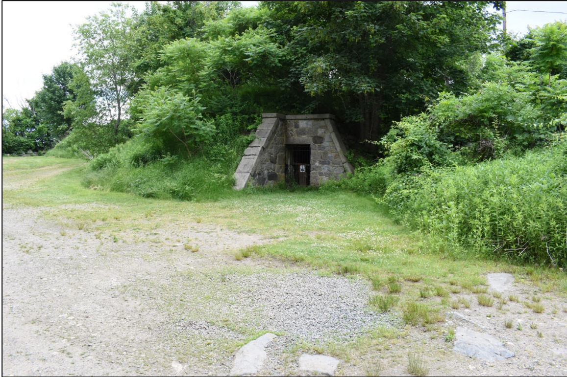
Photo 9. Ammunition storage in Fort Pickering, view southeast.