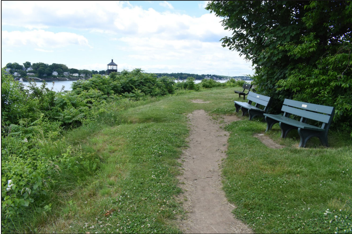
Photo 7. Dirt trail and park features on Fort Pickering's west side, view south with Fort Pickering Lighthouse partially visible.