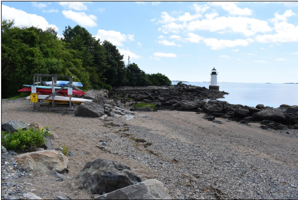
Photo 1. South side of Fort Pickering, Winter Island Revetments, and Fort Pickering Lighthouse (left to right), view northeast.