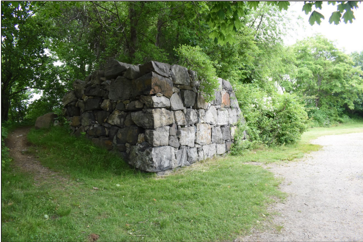
Photo 10. Fort Pickering walls, view northeast.