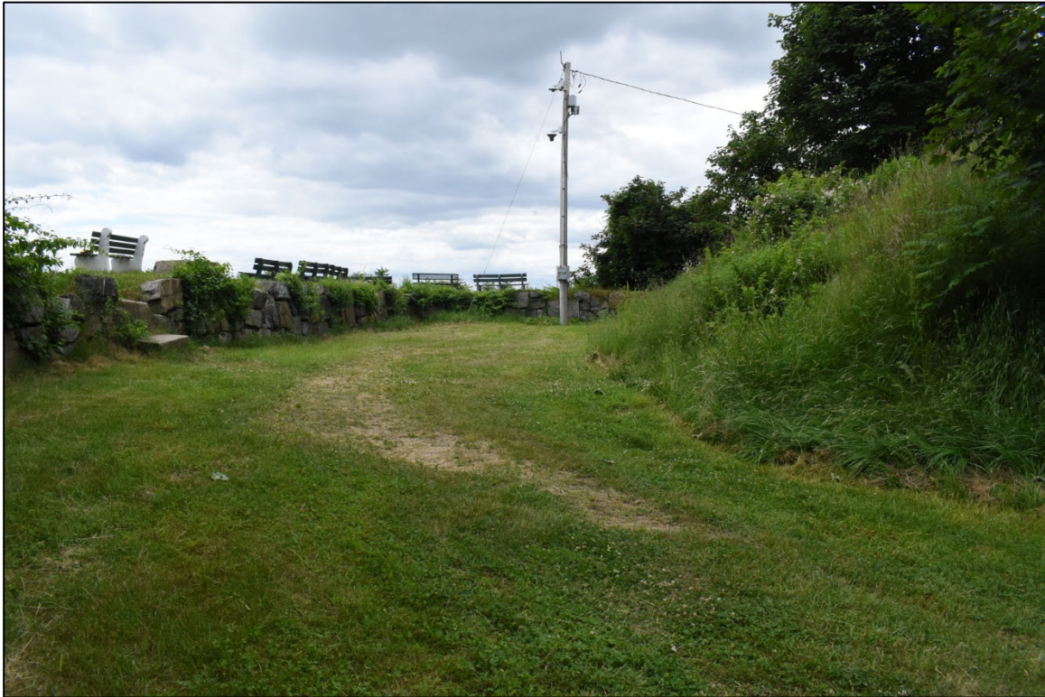
Photo 8. Interior of Fort Pickering, view south towards park amenities on south and east sides.